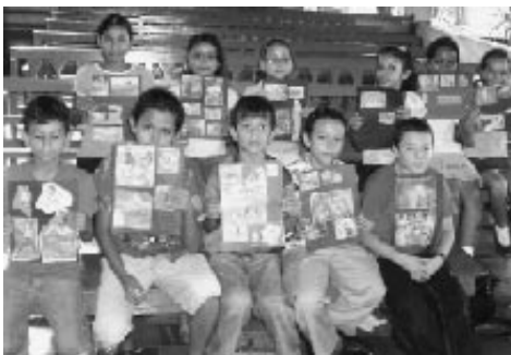
Students from Center holding their photo collages

The program started with an orientation session for the 12 children participating. They were given basic instruction in camera technique as proper use of light, contrast, color and viewing. There were also practice sessions using the Center's digital camera so that one might see immediate results and critique the work. Each then received a disposable camera and departed very excited about the week ahead when they would take their own pictures. The cameras were then turned in to prepare for the photo exchange with the Northampton students. Finally, booklets were created by each student which showed each of their photos along with written descriptions. The students are all quite excited about where such a project might lead in the future.