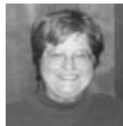
S. Helen Prejean Author, Anti-death penalty advocate